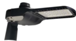
Pole top mounting