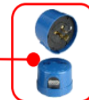
PE Cell (n/a in -N model)