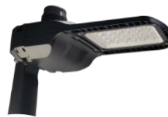
Pole top mounting