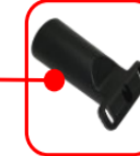
Ø36-40mm Spigot Replacement